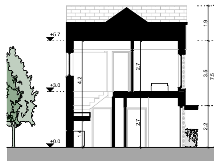
Section A-A SCALE 1:200

FOR ORIENTATION AND HANDING PLEASE REFER TO SITE PLAN