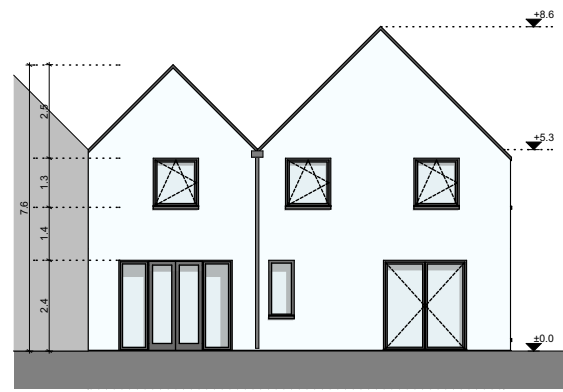
Rear Elevation SCALE 1:200