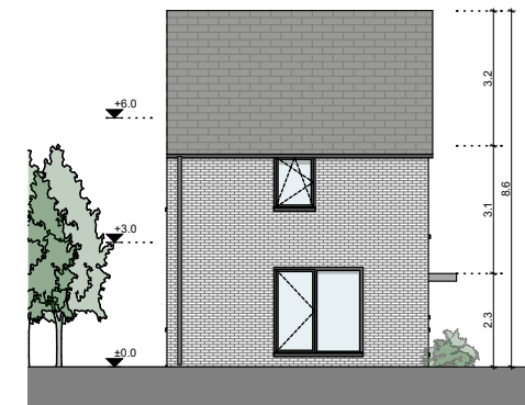
Side Elevation SCALE 1:200